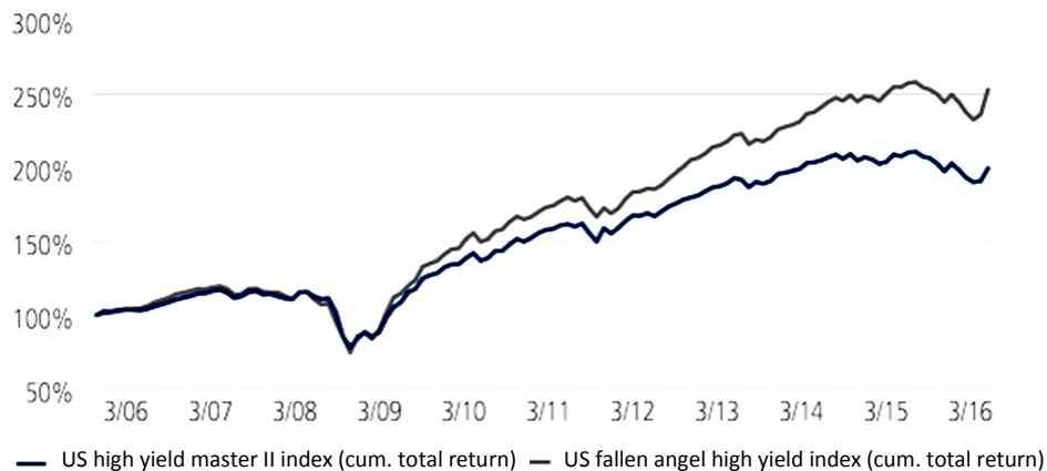
Chart 2: Fallen angels have outperformed the broader high yield market in the U.S.

Most managers agree (regardless of whether they have a high yield capability) – that fallen angels present a material investment opportunity for sub-investment grade managers. This is because historically, fallen angels have outperformed the broader high yield market, as shown below.