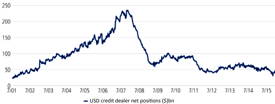
Chart 3: USD credit dealer net positions